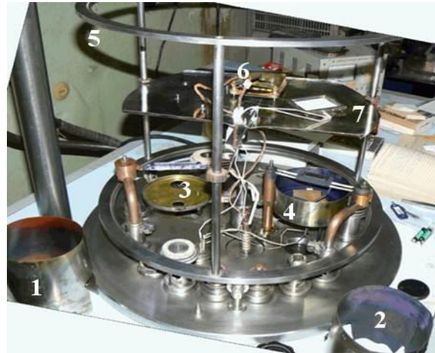
Fig. 1. Internal structure of the installation for spraying CdS and CdTe: 1, 2 – screens, 3 – evaporator for the powdered cadmium telluride; 4 – evaporator for the powdered cadmium sulfide; 5 – carousel, 6 – substrate heater; 7 – holder of the substrate

ment. The thickness of the base layer of CdTe was 2.5 μm. The outlay of internal equipment of the installation is shown in Fig. 1.