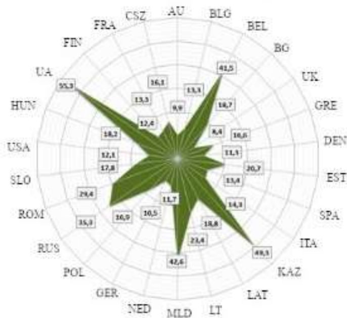
Fig. 2. Share of food costs in selected countries of the world [5]

Ensuring national food security is associated with overcoming the influence of negative factors that pose threats to food security, leading to a decrease in the quantity, absence or deterioration of the nutritional and energy value of the main types of food. These include: a significant excess of the threshold value of saturation of the domestic market with imported products; low level of effective public demand for food; price disparities in the market of agricultural and fish products, raw materials and food; violation of the stability of the financial and credit system; insufficient level of development of the internal market infrastructure; moral and physical aging of the